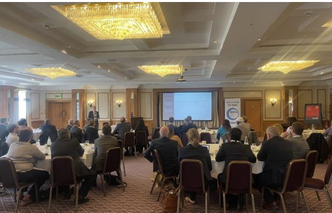
The conference in Northampton

This year, the BHTA and its members also supported a new government training initiative for ground handlers transporting mobility equipment.