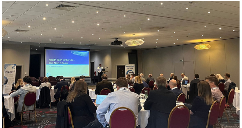
The BHTA's 2024 annual conference

BHTA members took part in creating the training video, supplying the equipment that was used in the guidance demonstration. Additionally, the BHTA updated its online Air Transport Information pages, which give detailed information about how to transport, remove the battery of, and safely store mobility equipment.