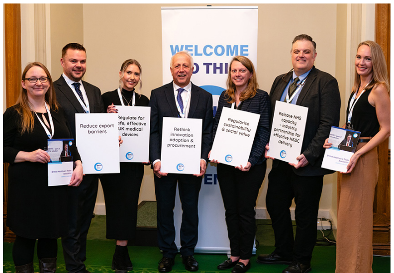
The BHTA Team at the Manifesto launch.

Working with Tendo, our political consulting partners, the BHTA created the “Preparing for a new Parliament: how to plan for the first 100 days of a new government” document to help guide members through the transition.