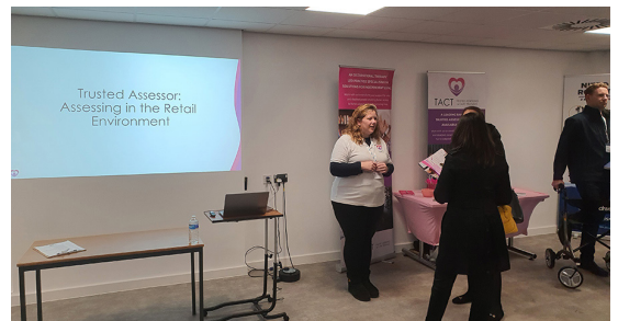
Trusted Assessors training-based programme launch

This new training-based programme enables customer-facing staff to learn the skills involved in assessing for suitable home adaptations equipment. The course was developed by TACT in consultation with the BHTA and its members, and it is accredited by OCN London.